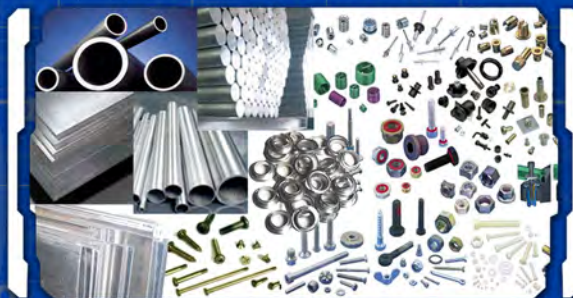
AEROSPACE RAW MATERIALS & MIL SPEC HARDWARE