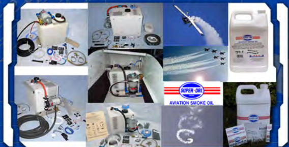
AIRCRAFT SMOKING KITS & SMOKE OILS