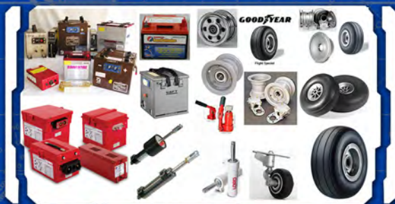
AIRCRAFT BATTERIES & TIRES