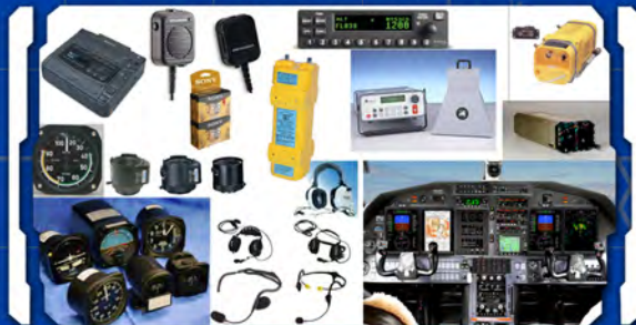
AVIONICS, TEST EQUIPMENTS & TOOLS